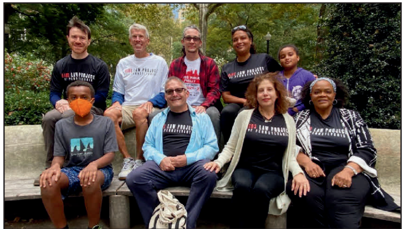
TOGETHER AGAIN: The AIDS Law Project’s Team 0008 was thrilled to participate together in AIDS Walk Philly 2021 on Oct. 17, a year after everyone had to walk separately because of the Covid pandemic.